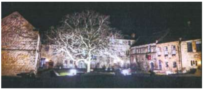
Blackfriars Restaurant, Newcastle upon Tyne The venue for our Post-Christmas Event January 2020